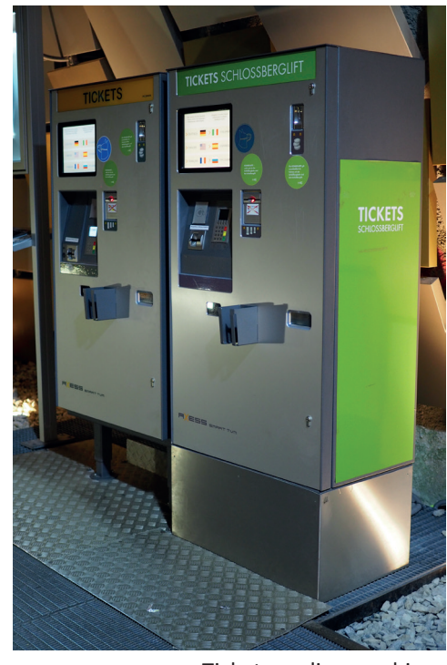
Ticket vending machines