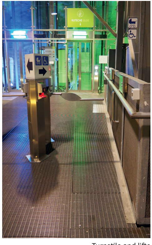
Turnstile and lifts