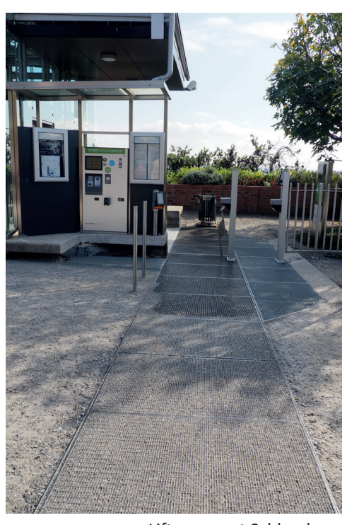
Lift access at Schlossberg