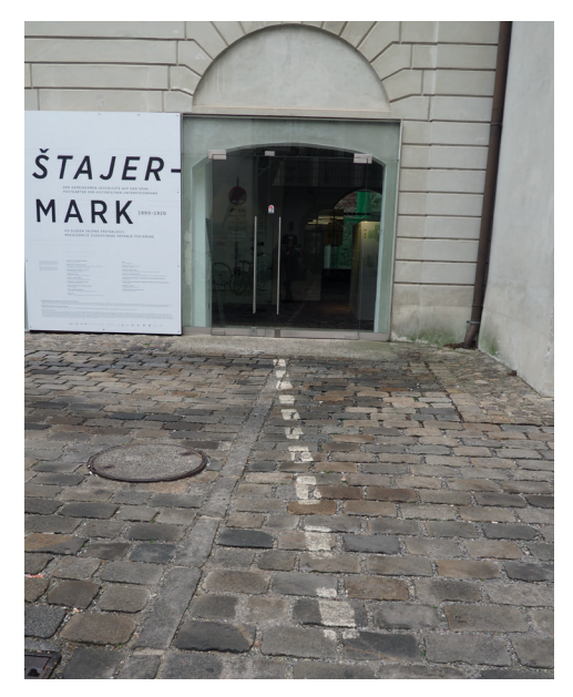
Entrance Gothic Hall