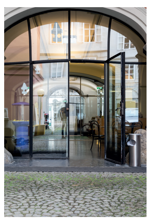
Entrance from courtyard