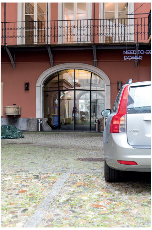
Car park in the inner courtyard