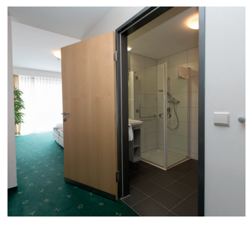
Entrance to bathroom in room