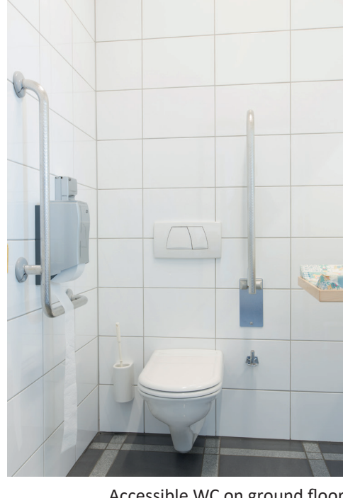
Accessible WC on ground floor