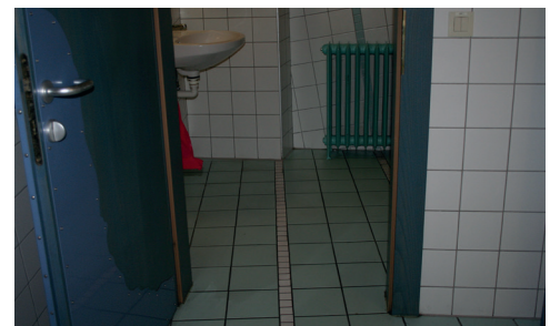
Door to toilet

Validity: April 2012, errors and omissions excepted, Graz Tourism in cooperation with Hartberg Disability Support Group