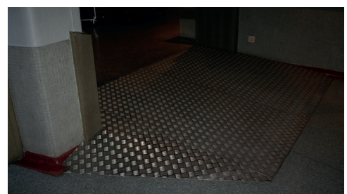
Ramp to interior area