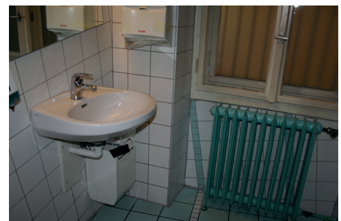
Washbasin and toilet

Validity: April 2012, errors and omissions excepted, Graz Tourism in cooperation with Hartberg Disability Support Group